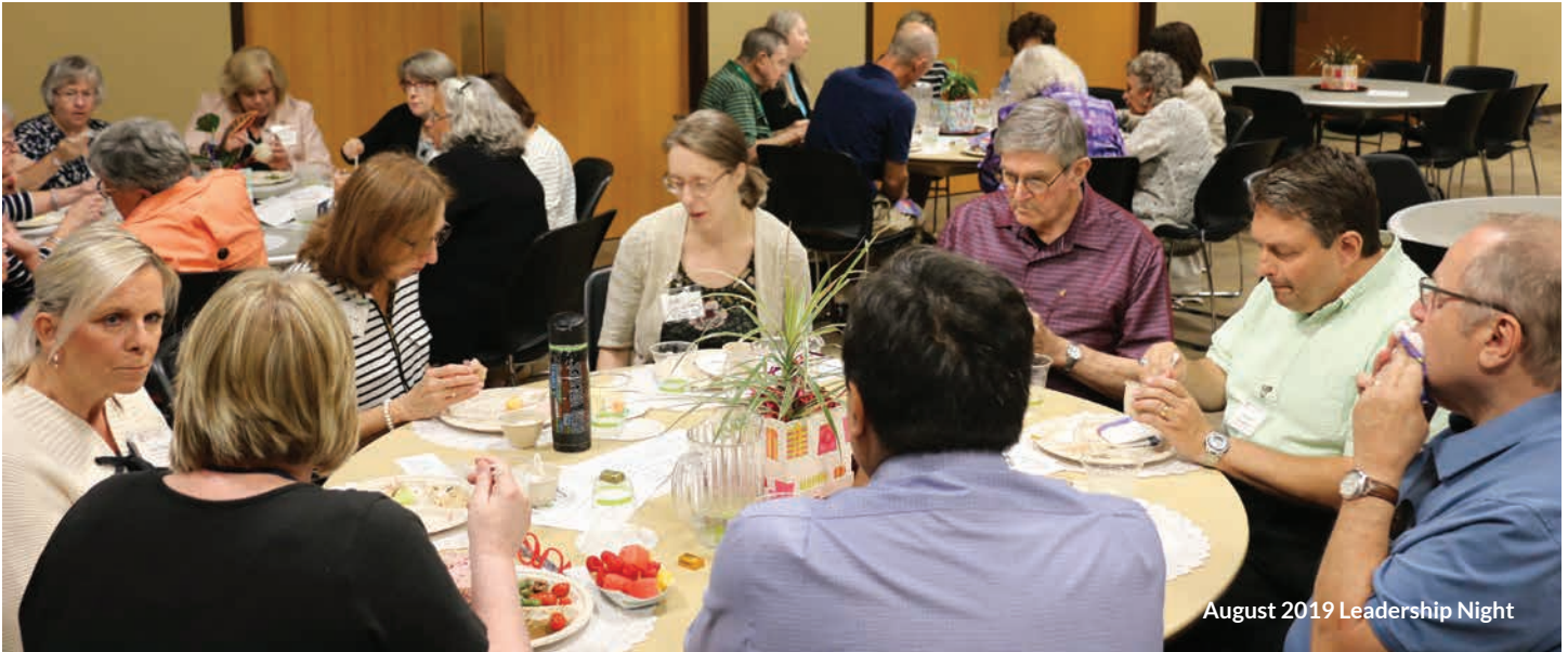
August 2019 Leadership Night