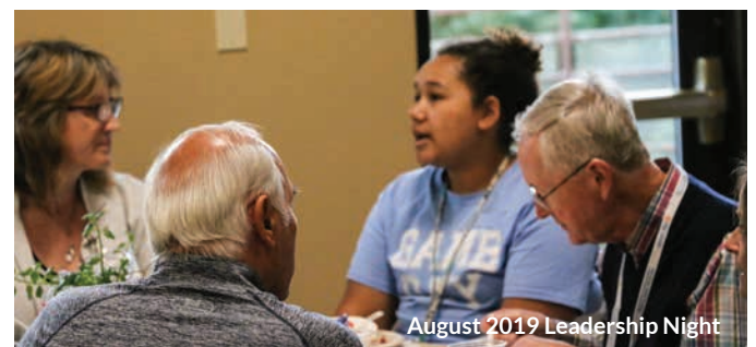
August 2019 Leadership Night